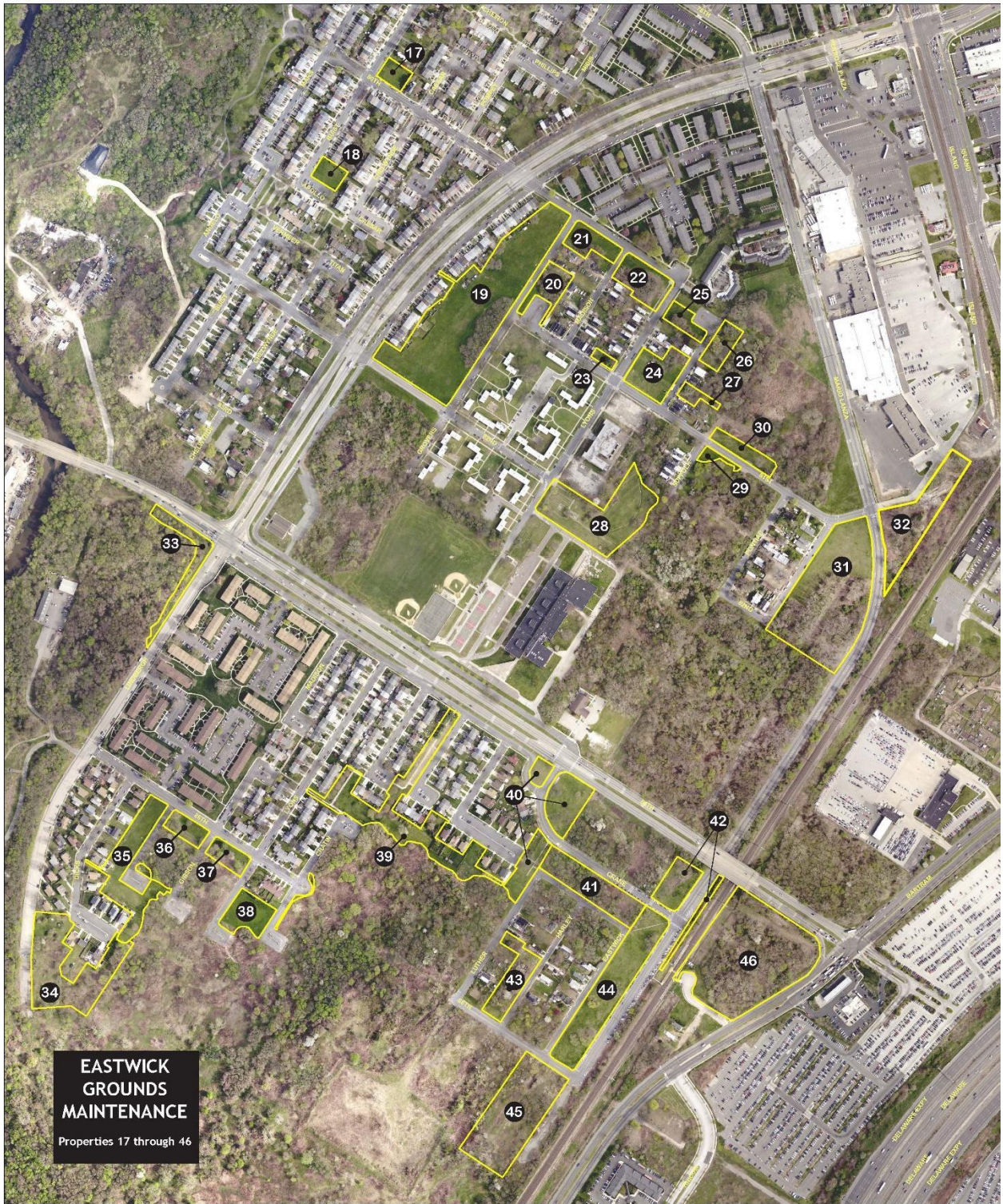
EASTWICK PARCELS MAP SOUTH