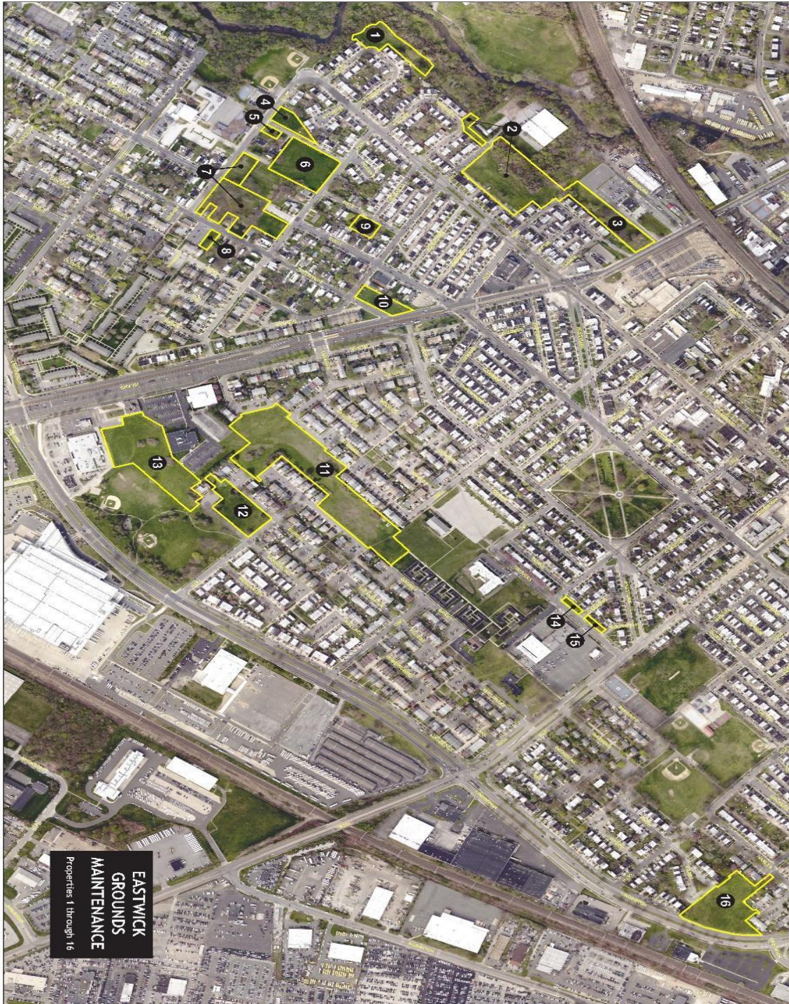
EASTWICK PARCELS MAP NORTH